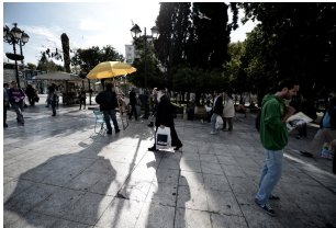
Syntagma Square on the... 26_05112013_15