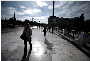
Syntagma Square on the... 26_05112013_12