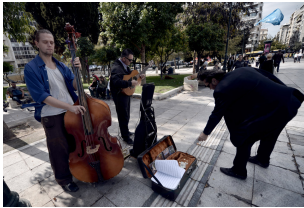
Syntagma Square on the... 26_05112013_16