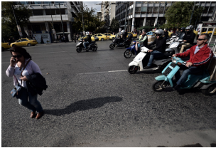
Syntagma Square on the... 26_05112013_18