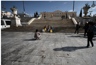
Syntagma Square on the... 26_05112013_13