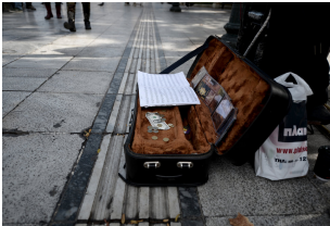
Syntagma Square on the... 26_05112013_14