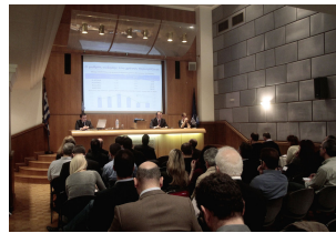
2014 State Budget /... 17_07213765