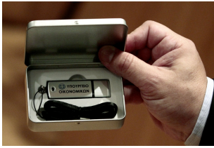
2014 State Budget /... 17_01213765