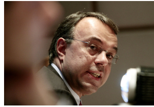
2014 State Budget /... 17_03213765