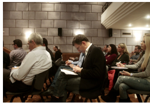
2014 State Budget /... 17_06213765