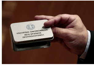
2014 State Budget /... 17_02213765