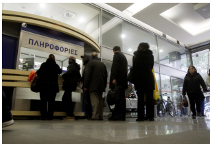
Premises of the Public... 17_1912124925