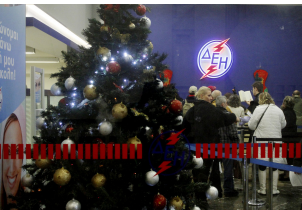
Premises of the Public... 17_211212492B5