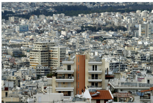
New real estate tax /... 17_0819120337