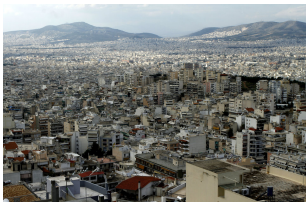
New real estate tax /... 17_0619120337