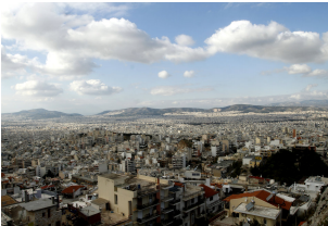
New real estate tax /... 17_0119120337