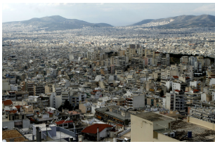
New real estate tax /... 17_0619120337