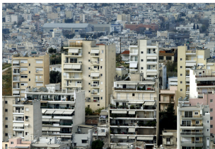
New real estate tax /... 17_0419120337