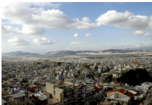
New real estate tax /... 17_0119120337