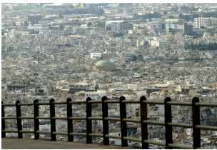
New real estate tax /... 17_0719120337