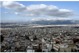
New real estate tax /... 17_0519120337