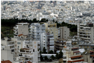
New real estate tax /... 17_0219120337