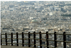
New real estate tax /... 17_0719120337