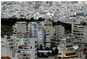
New real estate tax /... 17_0219120337