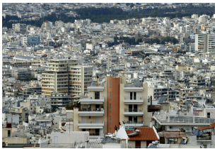
New real estate tax /... 17_0819120337