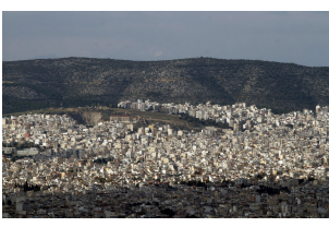
New real estate tax /... 17_0319120337