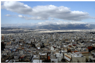
New real estate tax /... 17_0519120337