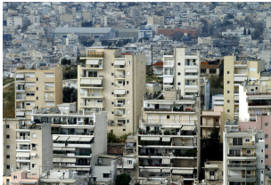
New real estate tax /... 17_0419120337