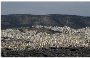
New real estate tax /... 17_0319120337