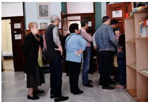
Municipal and Regional... 26_011477