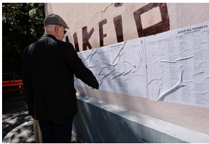
Municipal and Regional... 26_051437