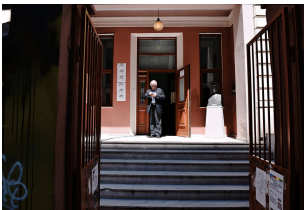
Municipal and Regional... 26_031477