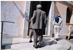
Municipal and Regional... 26_011437