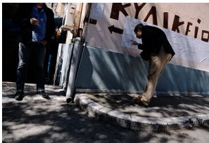
Municipal and Regional... 26_061437