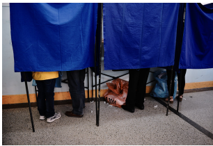
Municipal and Regional... 26_021437