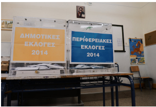
Municipal and Regional... 26_041437