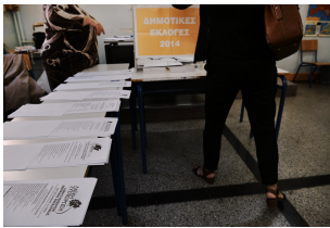
Municipal and Regional... 26_031437