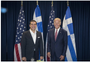
UN General Assembly /... 01_2630