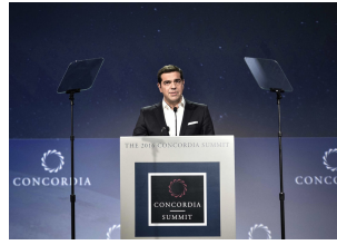
UN General Assembly /... 03_6783