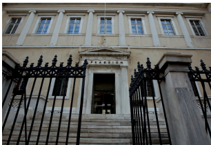
State Council /... 17_01181180