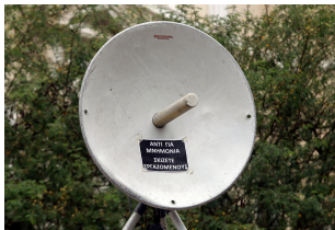
State Council /... 17_03181169