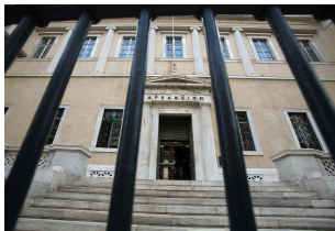
State Council /... 17_04181184