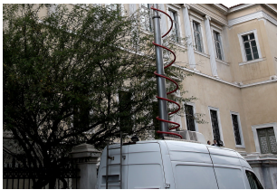
State Council /... 17_06181162